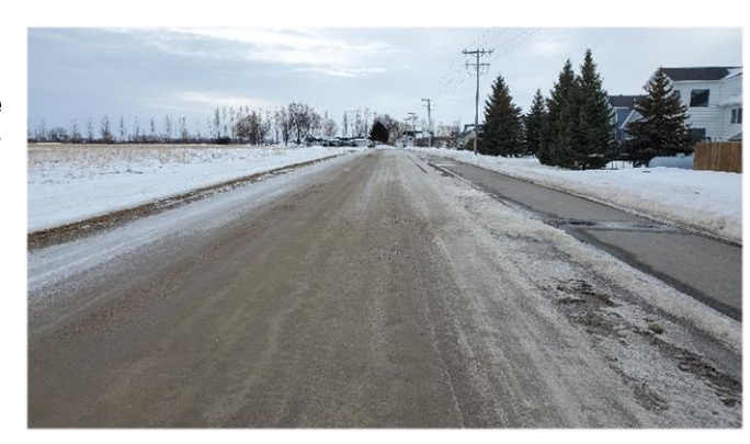
Southern gravel section of 13th Street.

The southern section is a gravel roadway. During the Spring and Fall, frost heaves create significant rutting that yields unpleasant and hazardous driving conditions. During dry summer months, dust clouds and even gravel debris threaten pedestrians and cyclists who use the adjacent path.