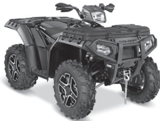
ATV (four wheeler)